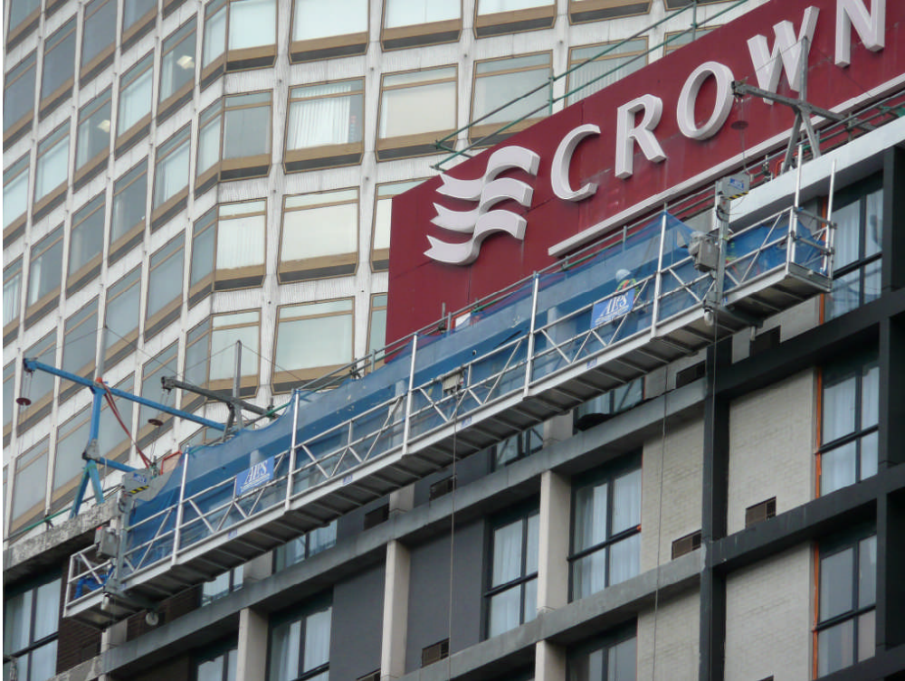
18M Temporary Suspended Access Platform (TSP)