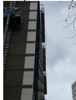
4 x 9M TSP's on main façade.

The main contractor "SISKS" chose ALPS and its modular Temporary Suspended Platforms to access all façades of the building to enable façade refurbishment tasks to be carried out.