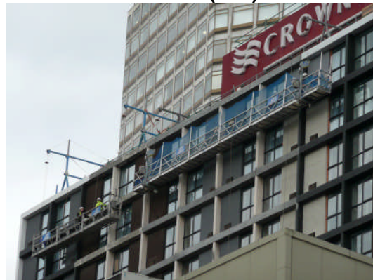
9M Temporary Suspended Platform adjacent to 18M TSP. (27M of powered suspended access)