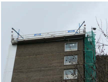
11M TSP; Full width of gable end: